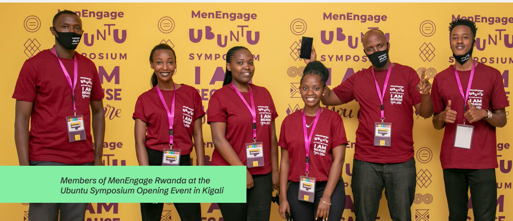
Members of MenEngage Rwanda at the Ubuntu Symposium Opening Event in Kigali