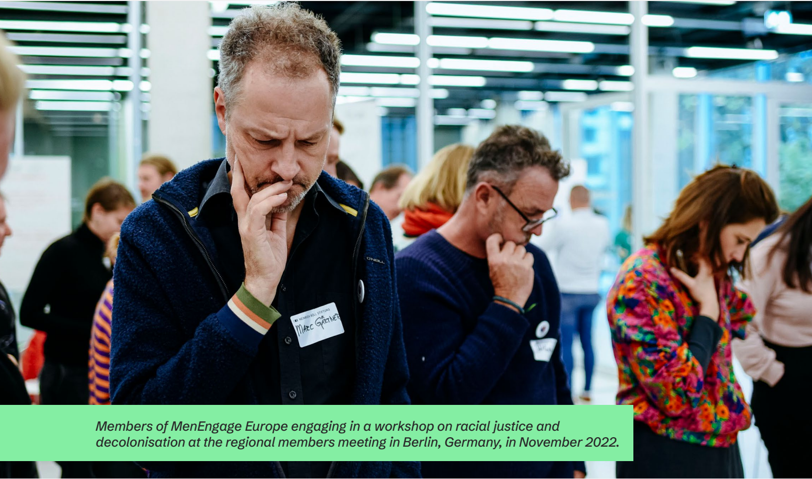
Members of MenEngage Europe engaging in a workshop on racial justice and decolonisation at the regional members meeting in Berlin, Germany, in November 2022.

frameworks for putting racial justice and decolonisation into practice in their lives and work. The series was made available online and has attracted more than 1,000 views.